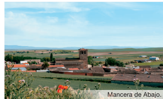
Mancera de Abajo.