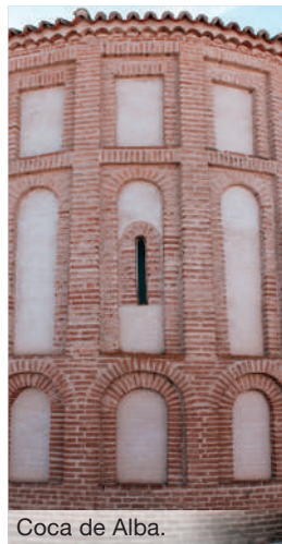
Coca de Alba.