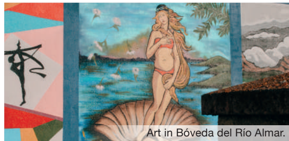
Art in Bóveda del Río Almar.