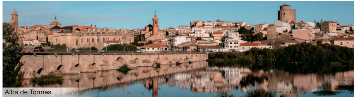
Alba de Tormes.