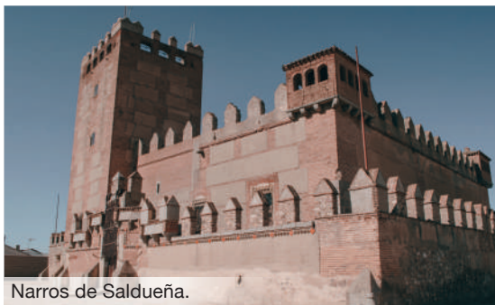
Narros de Saldueña.