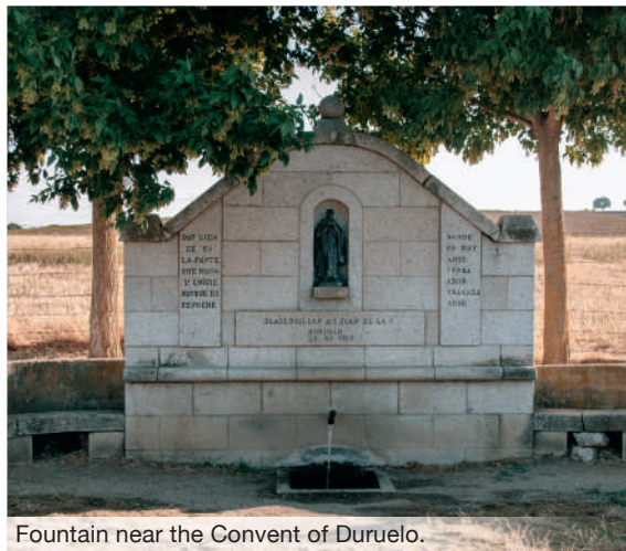
Fountain near the Convent of Duruelo.